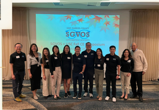
Fall symposium at Doubletree, Monrovia