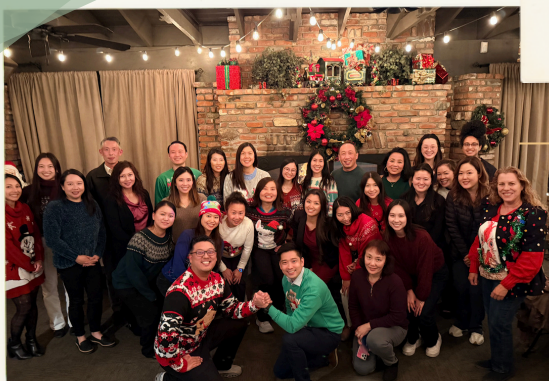
Back at the Derby in Arcadia for our holiday party