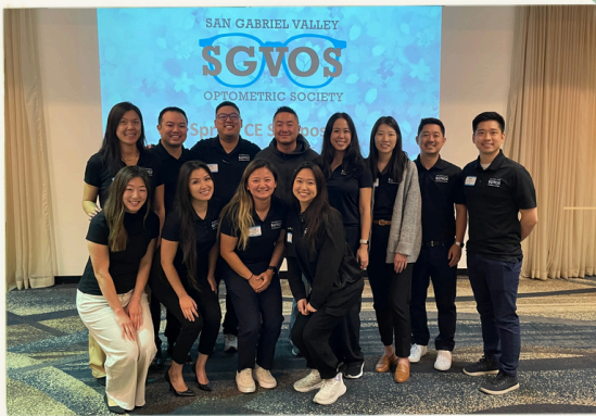
Spring symposium at Doubletree, Monrovia