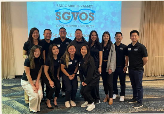
Spring symposium at Doubletree, Monrovia