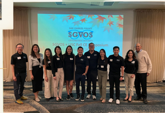
Fall symposium at Doubletree, Monrovia